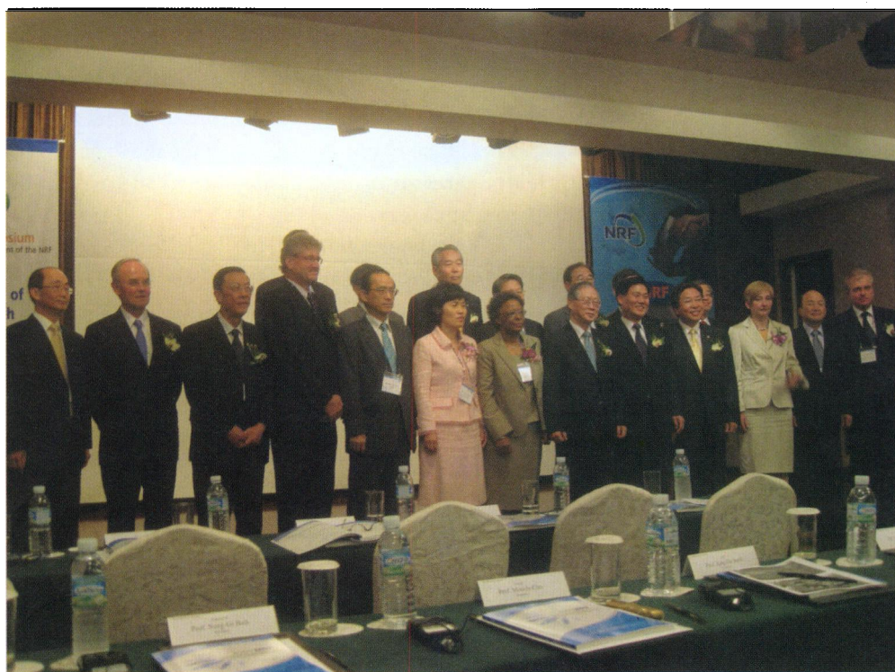
Group of the delegates to the Symposium.